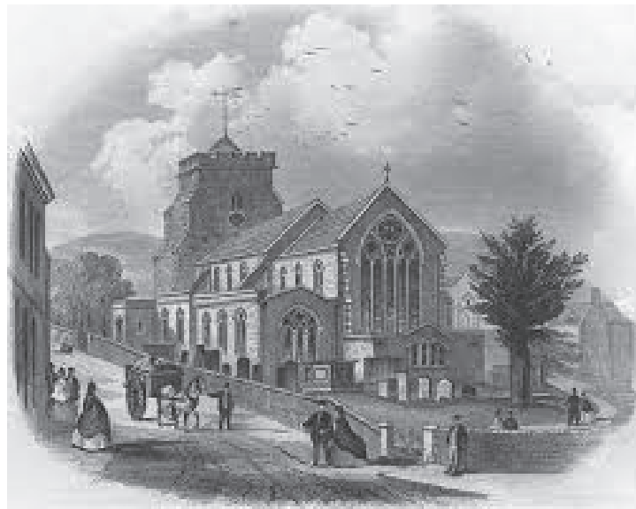
St. Mary's Church, Eastbourne